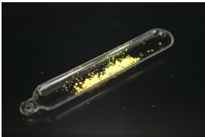
Excitation color at 366nm

All applications using this product should be thoroughly tested prior to approval for production.