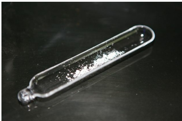
Appearance at visible light